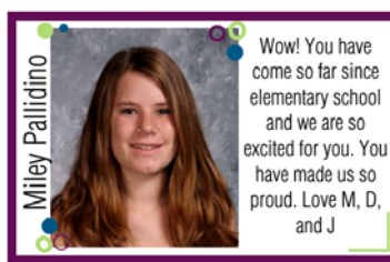
Modern - $38